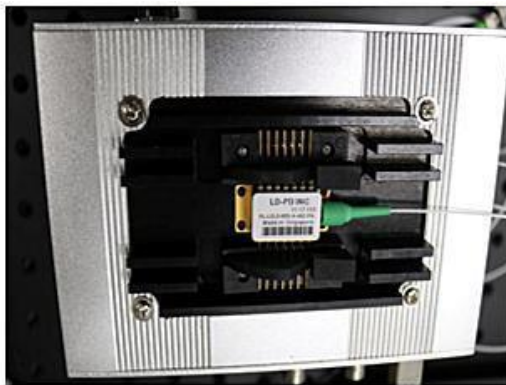
1550nm PM SLD Laser diode

Single point data test 1X2, 50:50, 1550nm polarization-maintaining fiber coupler (broadband SLD center wave 1550nm, spectrum width: 30nm, 2.5mw polarization-maintaining SLD laser test as an example)