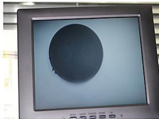
Slow axis alignment