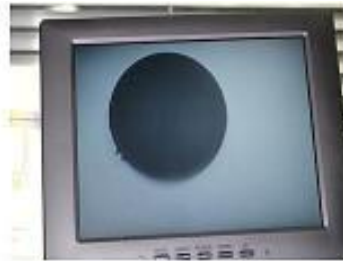
Slow axis alignment