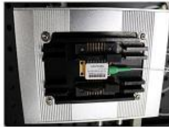
1550nm PM SLD Laser diode

Single point data test 1X2, 50:50, 1550nm polarization-maintaining fiber coupler (broadband SLD center wave 1550nm, spectrum width: 30nm, 2.5mw polarization-maintaining SLD laser test as an example)