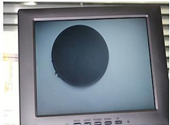
Slow axis alignment