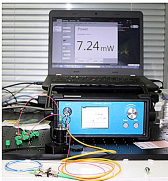
NIR-FBC-W1922 red port@1950nm